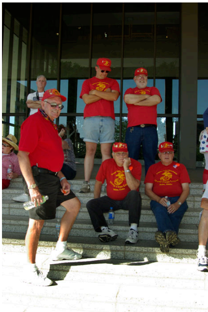
4th of July Parade