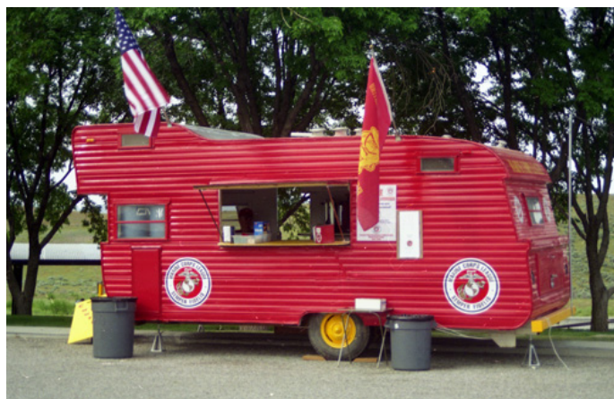
Coffee Wagon on location at Blacks Creek rest-stop

Koffee Klatch starts at 0900, although you can show up as early as you want, but you should wait until they open. Koffee Klatch is held at Quinn's on Vista Ave. every Saturday morning, except the third Saturday of the month. That day is our Happy Hour Breakfast with the ladies and guests.. Happy Hour is at 1000 hours and this month it will be on August 18th.